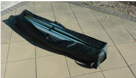
Place marquee frame back into black bag that it was removed from.