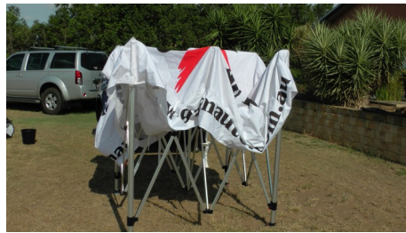
Lower marquee on all four corners, then release latches to fold marquee up to about a metre apart. Remove marquee canopy and lay on ground.