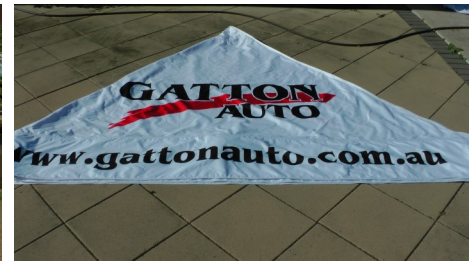
Lay top out flat from corner to corner to make a triangle.