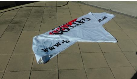
Fold marquee canopy as per the following pictures.