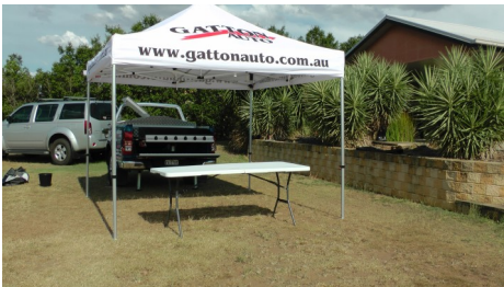
Remove pegs, ropes or sandbags from marquee. Don't forget to undo straps from inside top of marquee canopy.