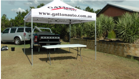
Lift frame at yellow marked areas until frame locks into place.