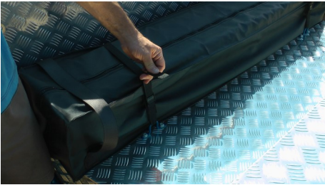
Remove Marquee frame from front of trailer deck.