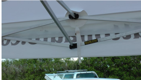
Secure centre strips in all four places.