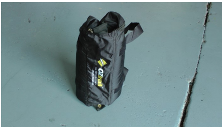
Sand bags are also supplied to place on all four corners of marquee for when it is set up on hard surfaces.