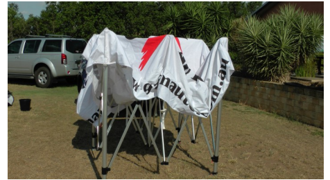
Remove Marquee cover from front box and place cover over frame so that each corner of cover sit into position where velco is located on each corner.