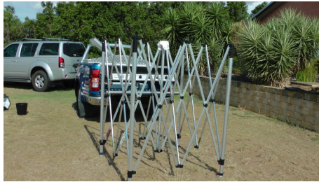
Stand frame up and open so that all legs are about a meter or so apart.